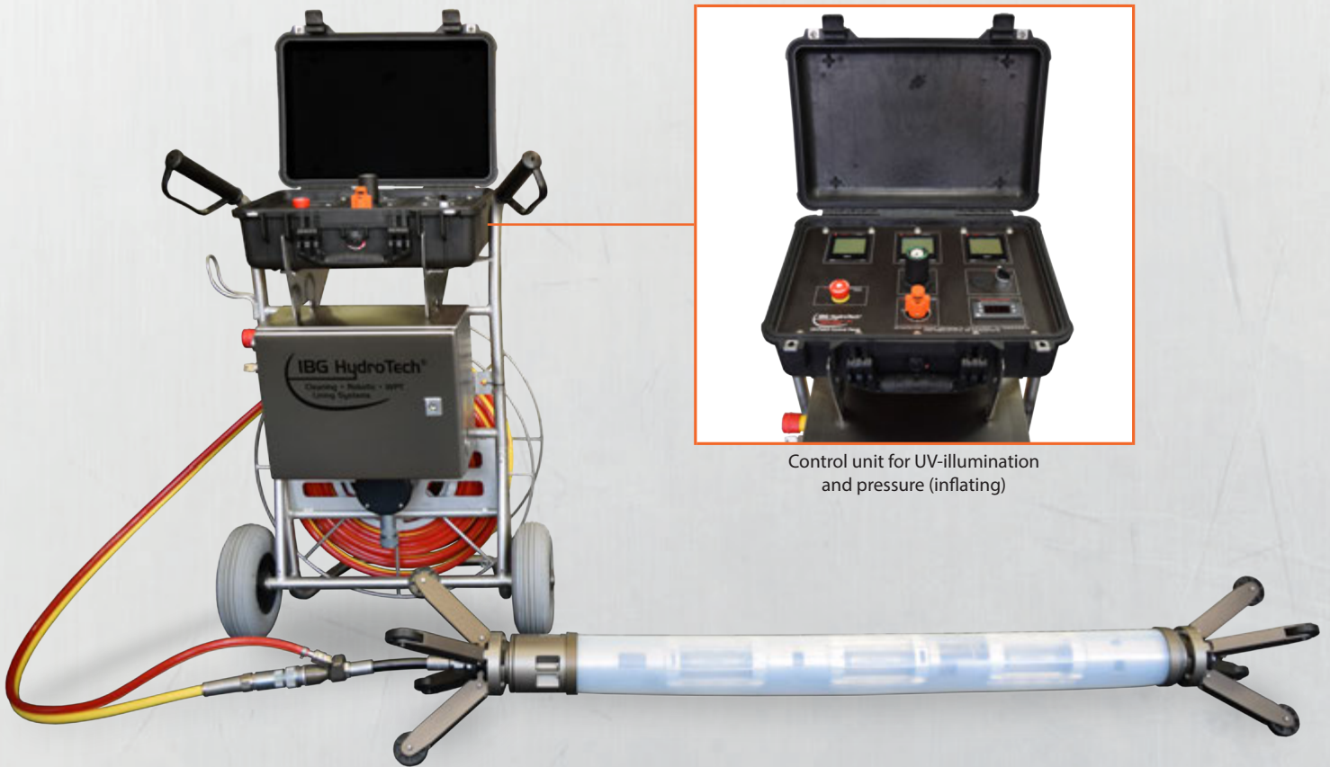
Control unit for UV-illumination and pressure (inflating)

The UV-Patch-System allows the rehabilitation of damaged pipe sections in lengths up to 1 meter (40")